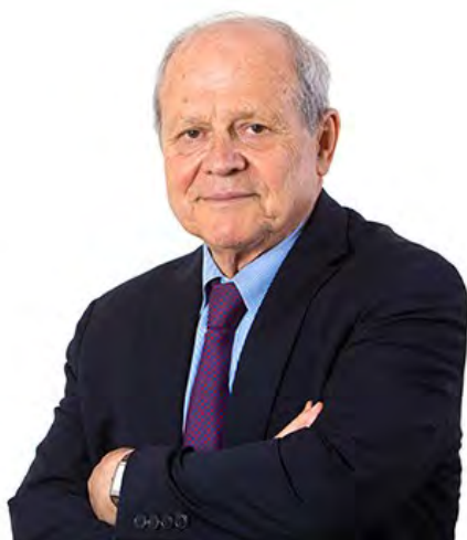
Prof. Tiziano Treu President ISLSSL

“ It is our pleasure to welcome you to the XXII World Congress of the International Society for Labour and Social Security Law (ISLSSL) on “Transformations of Work: challenges for the National Systems of Labour Law and Social Security” which will be held from 4 to 7 September 2018 in Turin, Italy.