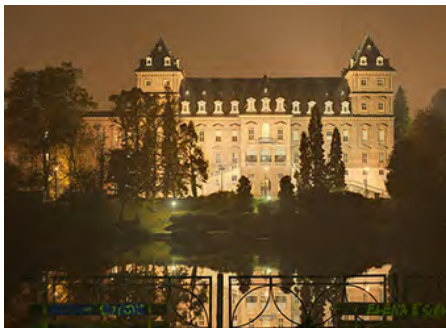
Art and Architecture

Turin's province offers an impressively varied and fascinating wealth of art and environmental treasures ranging from ancient hamlets to eco-museums, archaeological sites and religious architecture in the grand style.