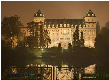
Art and Architecture

Turin's province offers an impressively varied and fascinating wealth of art and environmental treasures ranging from ancient hamlets to eco-museums, archaeological sites and religious architecture in the grand style.